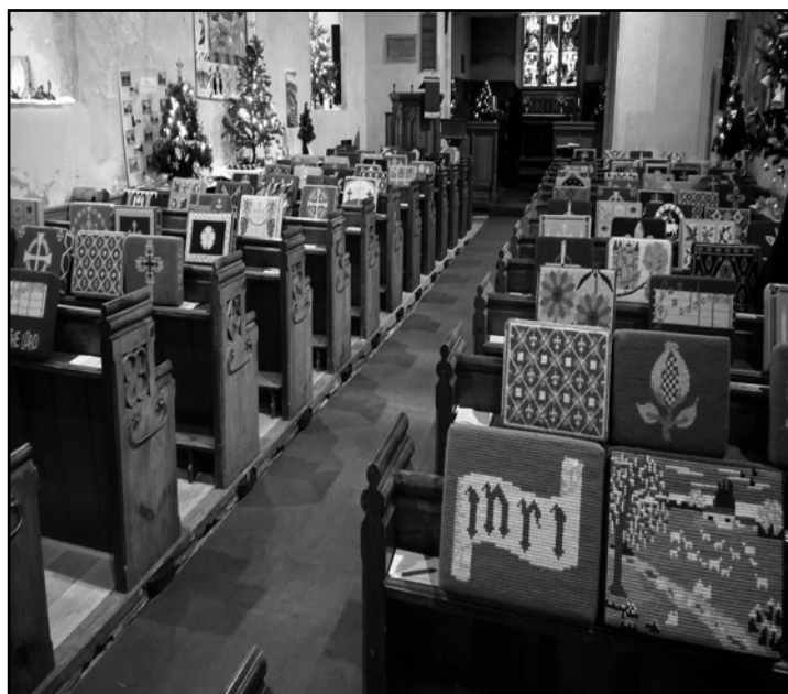
St Andrew's Christmas Tree Festival 2015

I am sure that everyone is organised and got their lists written, for shopping for the inordinate amount of food that we consume over the Christmas season, but please do spare a thought and maybe a donation to those for whom this is not quite the easiest of times. At St Margaret's we have in the past made a donation to the St Martins Housing Trust particularly at this time. This is the charity that supports the homeless people in Norwich, to ensure that they too have a Good Christmas. I appreciate that, at this time of year, we are bombarded with appeals from a whole variety of charities, and it is difficult to choose which one to support, but we are so fortunate to have what we