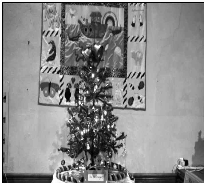
St Andrew's Christmas Tree Festival 2015